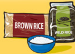
Cooked rice, bulgur or quinoa 125 mL (½ cup)