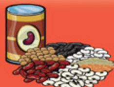
Cooked legumes 175 mL (¾ cup)