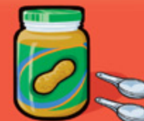
Peanut or nut butters 30 mL (2 Tbsp)