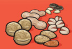
Shelled nuts and seeds 60 mL (¼ cup)