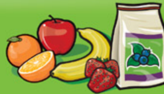
Fresh, frozen or canned fruits 1 fruit or 125 mL (½ cup)